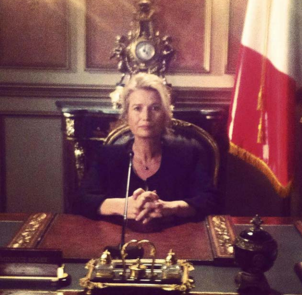
French Foreign Minister Dominique Roget